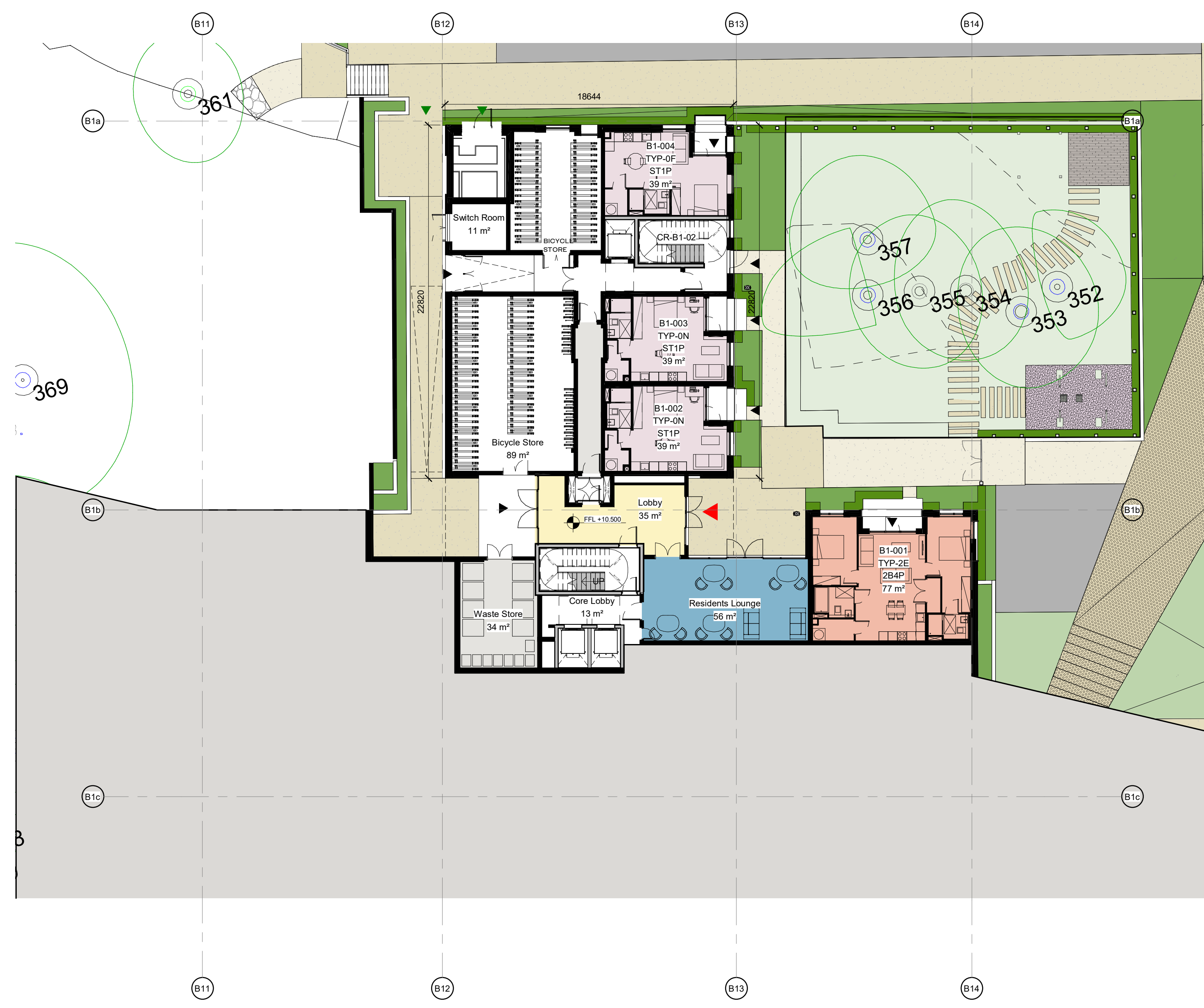
1 BLOCK B1-LEVEL B1 1 : 200