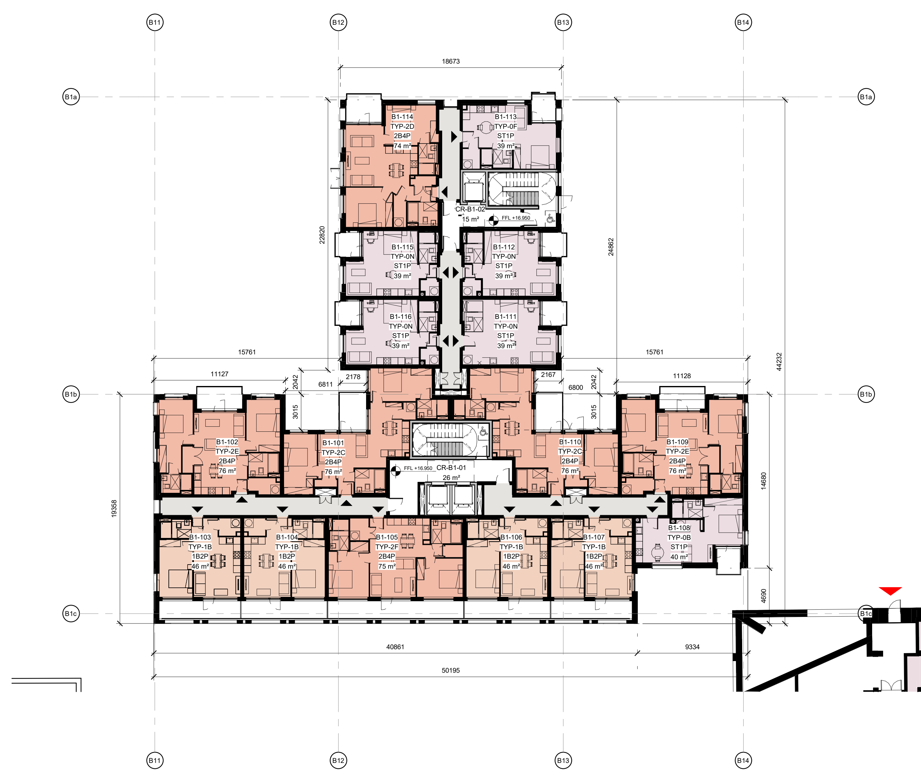
4 BLOCK B1-LEVEL 01 1 : 200